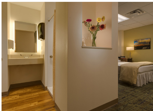
Lovelace Westside Hospital Sleep Center