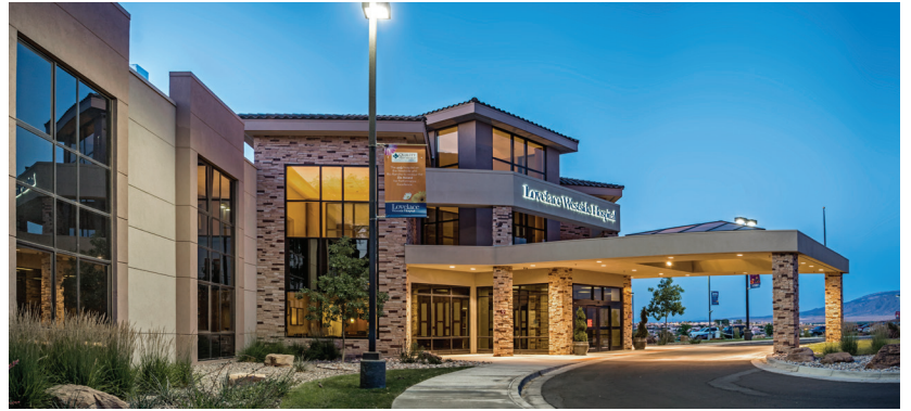
Lovelace Westside Hospital

For over 30 years, Lovelace Westside Hospital has been committed to offering Rio Rancho and Westside residents the highest quality care.