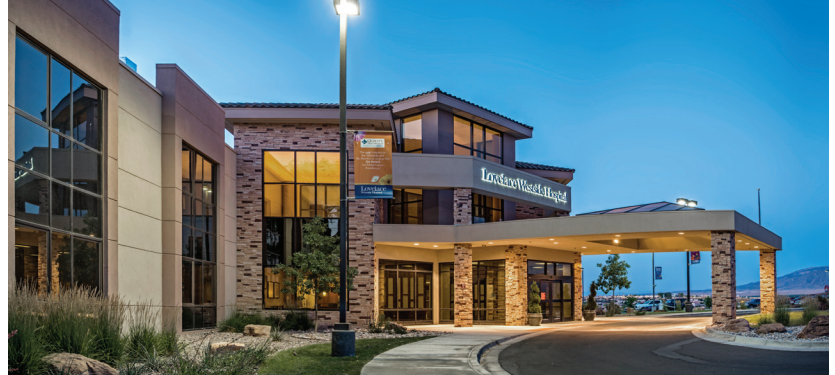
Lovelace Westside Hospital

For over 30 years, Lovelace Westside Hospital has been committed to offering Rio Rancho and Westside residents the highest quality care.